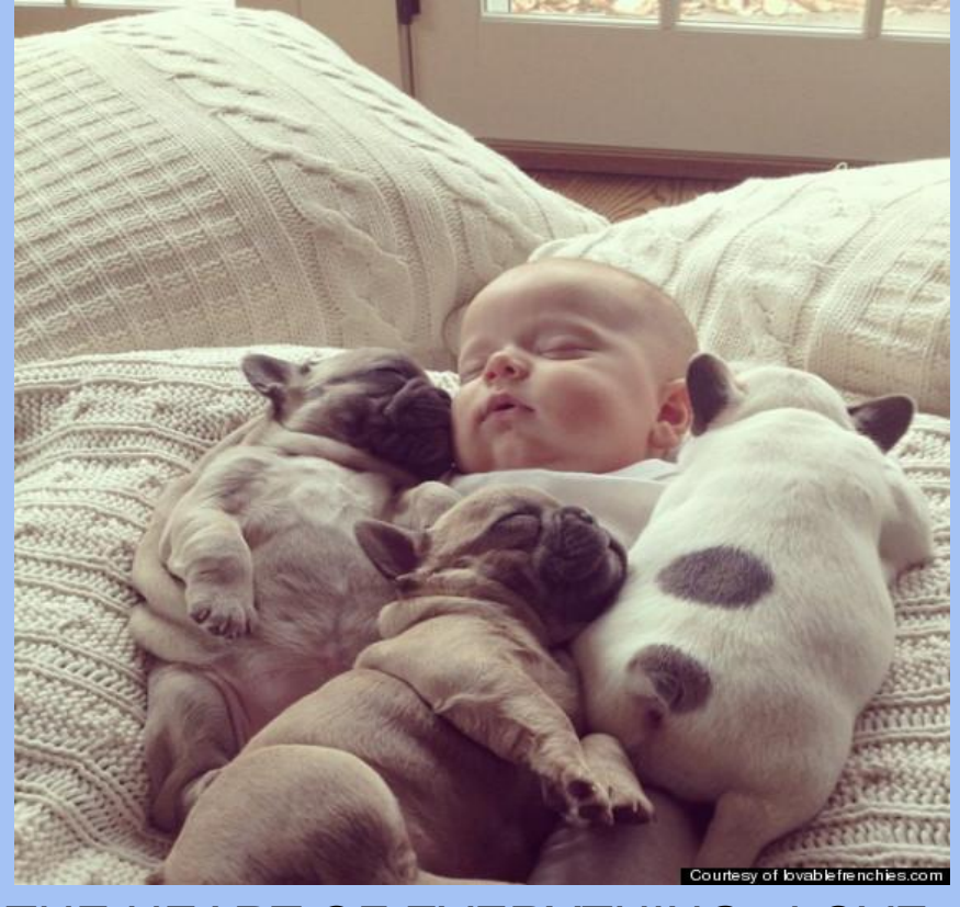
LOVE IS AT THE HEART OF EVERYTHING. LOVE, OR THE LACK OF IT.