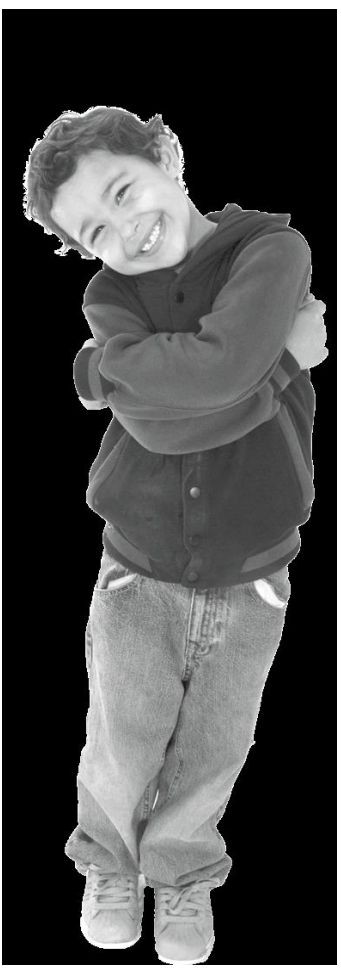
For more helpful tips, visit www.asdk12.org